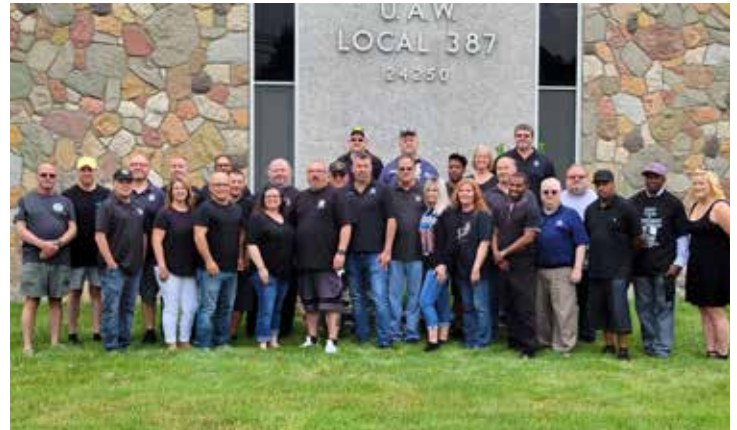
Our newly elected officials

UAW Local 387 just had their Triennial election in May. I would like to thank everyone that voted and participated in this election. Our members came out in great numbers to voice their opinions. During this election I noticed some awesome campaign flyers and slogans that shows the creativity of our brothers and sisters of this membership. With all the members that ran, it really puts pressure on all the newly elected officials to try to do the best they can for our Local. With that being