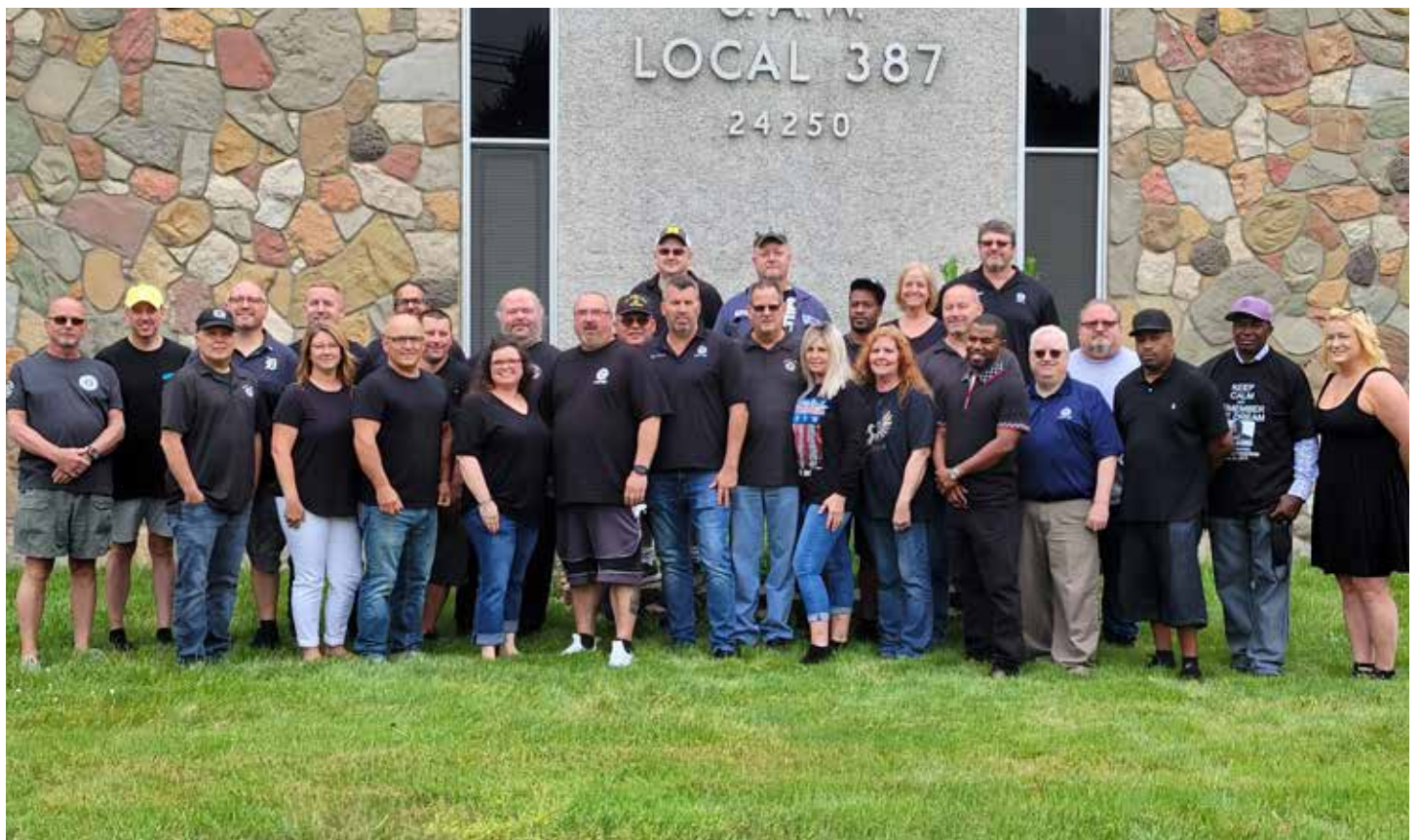
Our newly elected officials