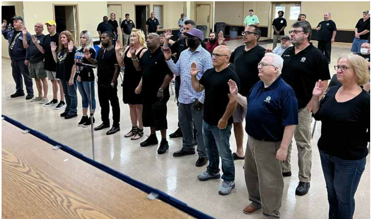
Our newly elected officials being sworn in