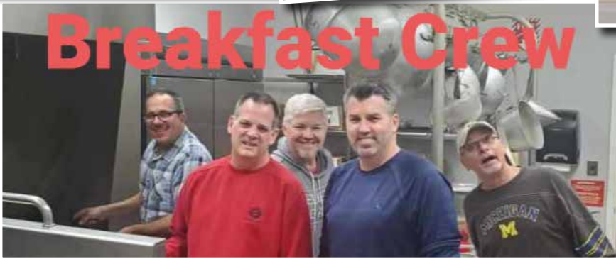
Was kicked out for bad behavior